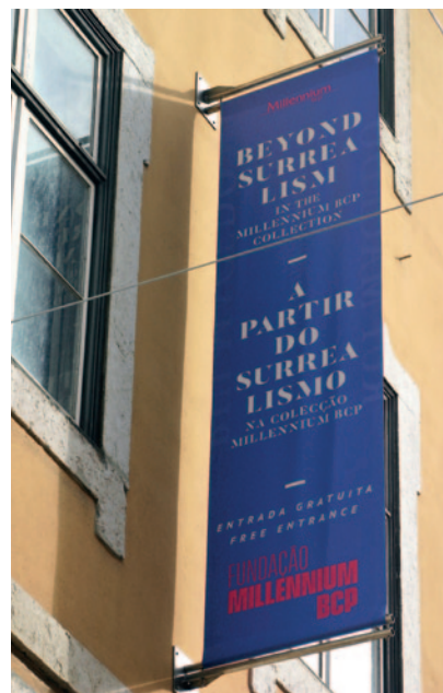
Beyond Surrealism includes works of art from eight artists of the Millennium bcp Collection.

THE FOUNDATION FOCUSES ITS ACTIVITY MAINLY ON CULTURE.