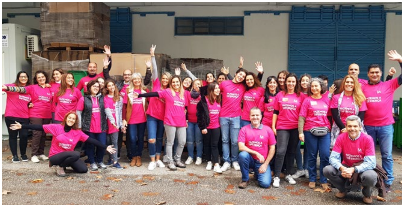
Food Bank Against Hunger.