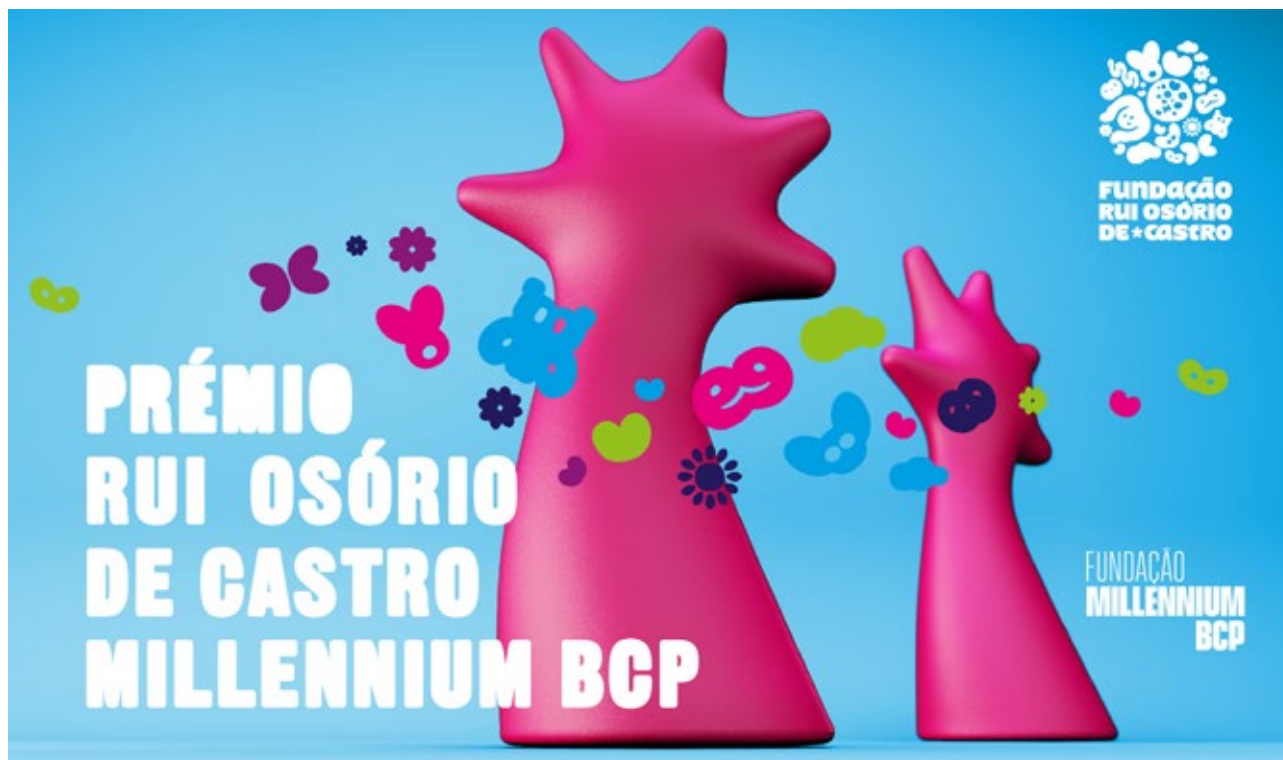
Foundation Rui Osório de Castro.