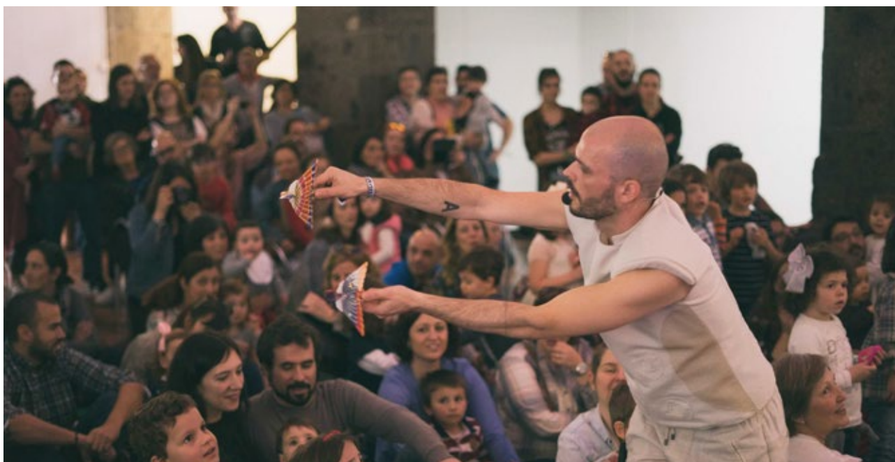
Associação Cultural Plutão Camaleão: support for artistic residencies and the "Mini Tremor" space at Festival Tremor on the island of S. Miguel, Azores.

Route, involving the holding of events in the cistercian monuments, the majority located in remote places, providing a cultural offer that, otherwise, local audiences would not be able to enjoy. In 2019, the Festival held four performances within the scope of the Route of Cister.