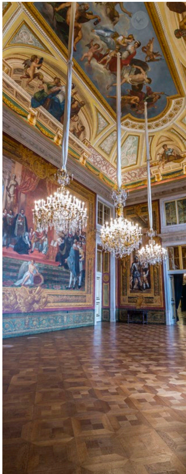
Room D. João IV.