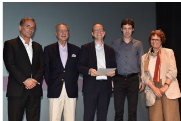
Award ceremony of the Triennial of Architecture.