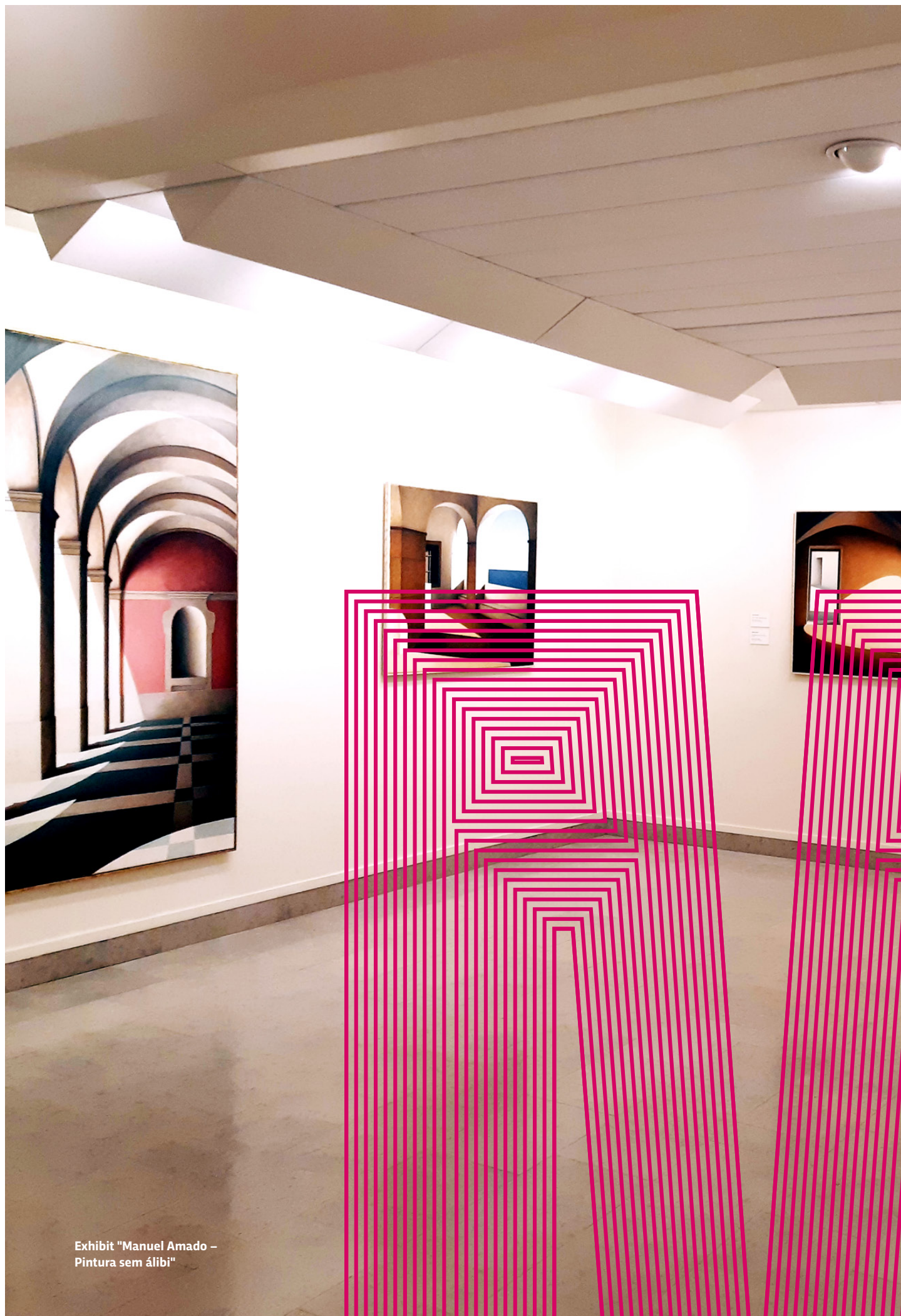
Exhibit "Manuel Amado – Pintura sem álibi"