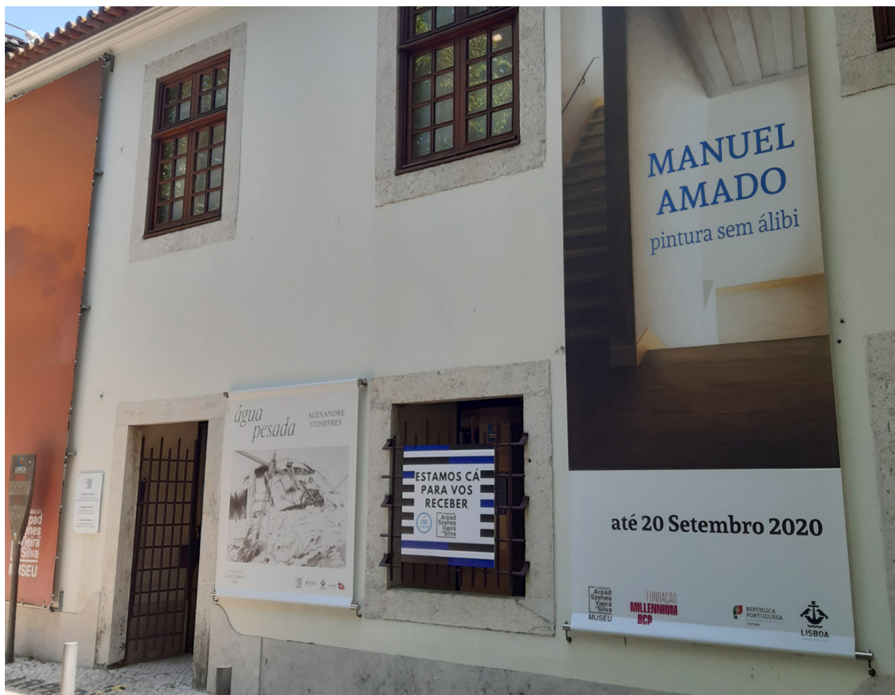
Exhibit "Manuel Amado – Pintura sem álibi", at Fundação Arpad-Szenes Vieira da Silva, in Lisbon.

The extension and depth of the impacts provoked by Covid-19, that led to a quite significant aggravation of the living conditions and isolation of the most fragile populations, gave rise to a special follow-up and support to the projects launched in order to mitigate the effects of this pandemic.