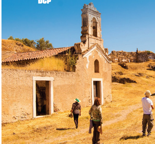
Research “Cultural Heritage in Portugal: Assessment of the Social and Economic Value”.