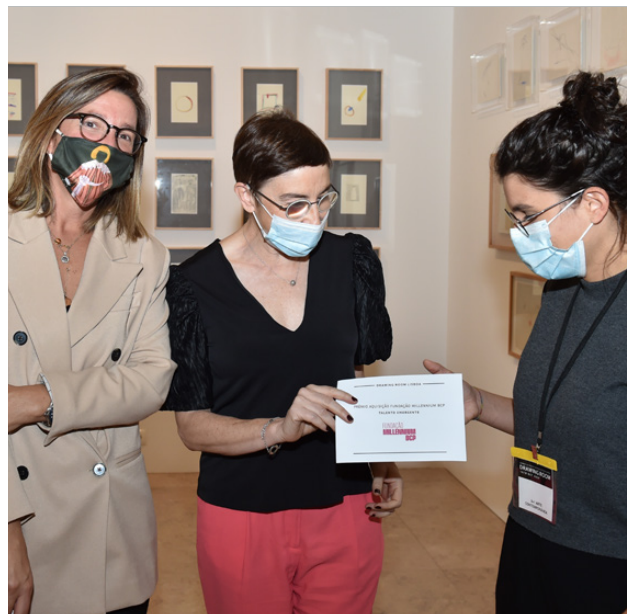
"Drawing Room Lisboa 2020".