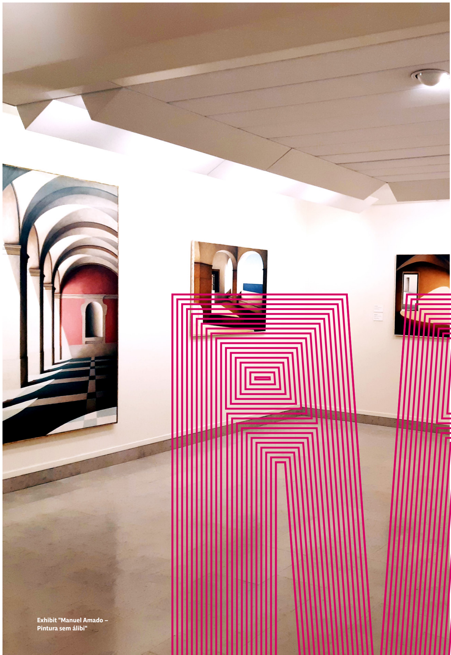
Exhibit "Manuel Amado – Pintura sem álibi"