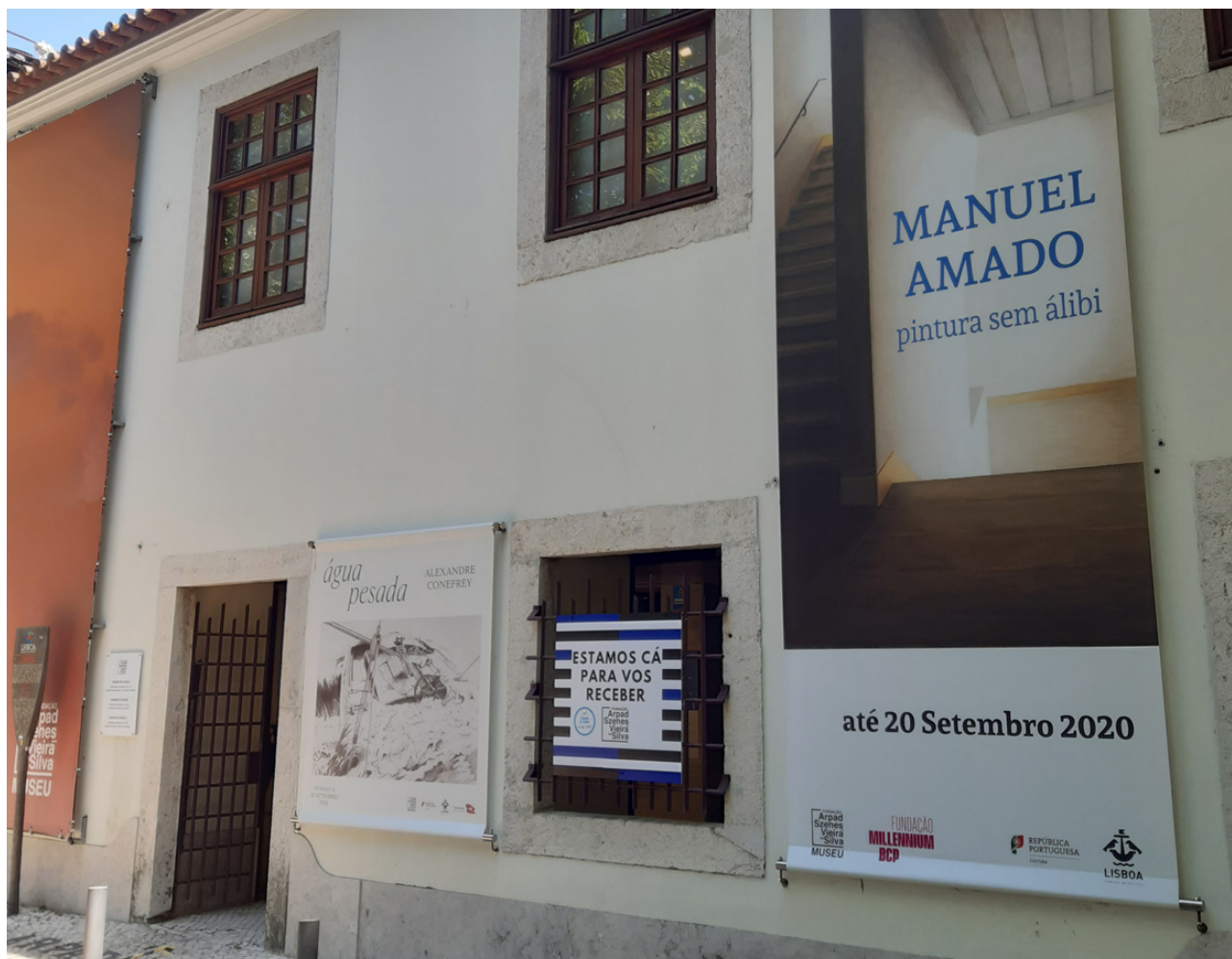
Exhibit "Manuel Amado – Pintura sem álibi", at Fundação Arpad-Szenes Vieira da Silva, in Lisbon.

The extension and depth of the impacts provoked by Covid-19, that led to a quite significant aggravation of the living conditions and isolation of the most fragile populations, gave rise to a special follow-up and support to the projects launched in order to mitigate the effects of this pandemic.