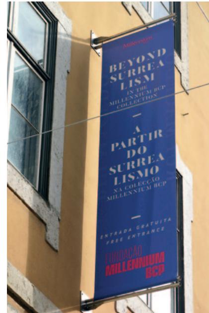
Beyond Surrealism includes works of art from eight artists of the Millennium bcp Collection.

THE FOUNDATION FOCUSES ITS ACTIVITY MAINLY ON CULTURE.