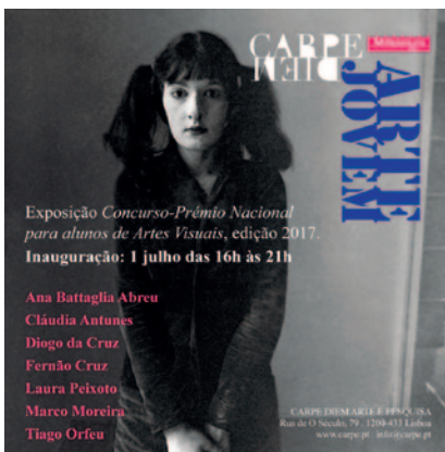
National award Young Art aims to disclose new artists.