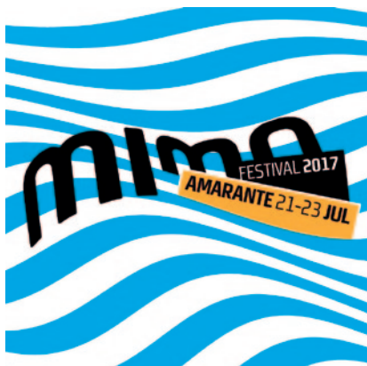
Festival Mimo 2017 had 196 participants.